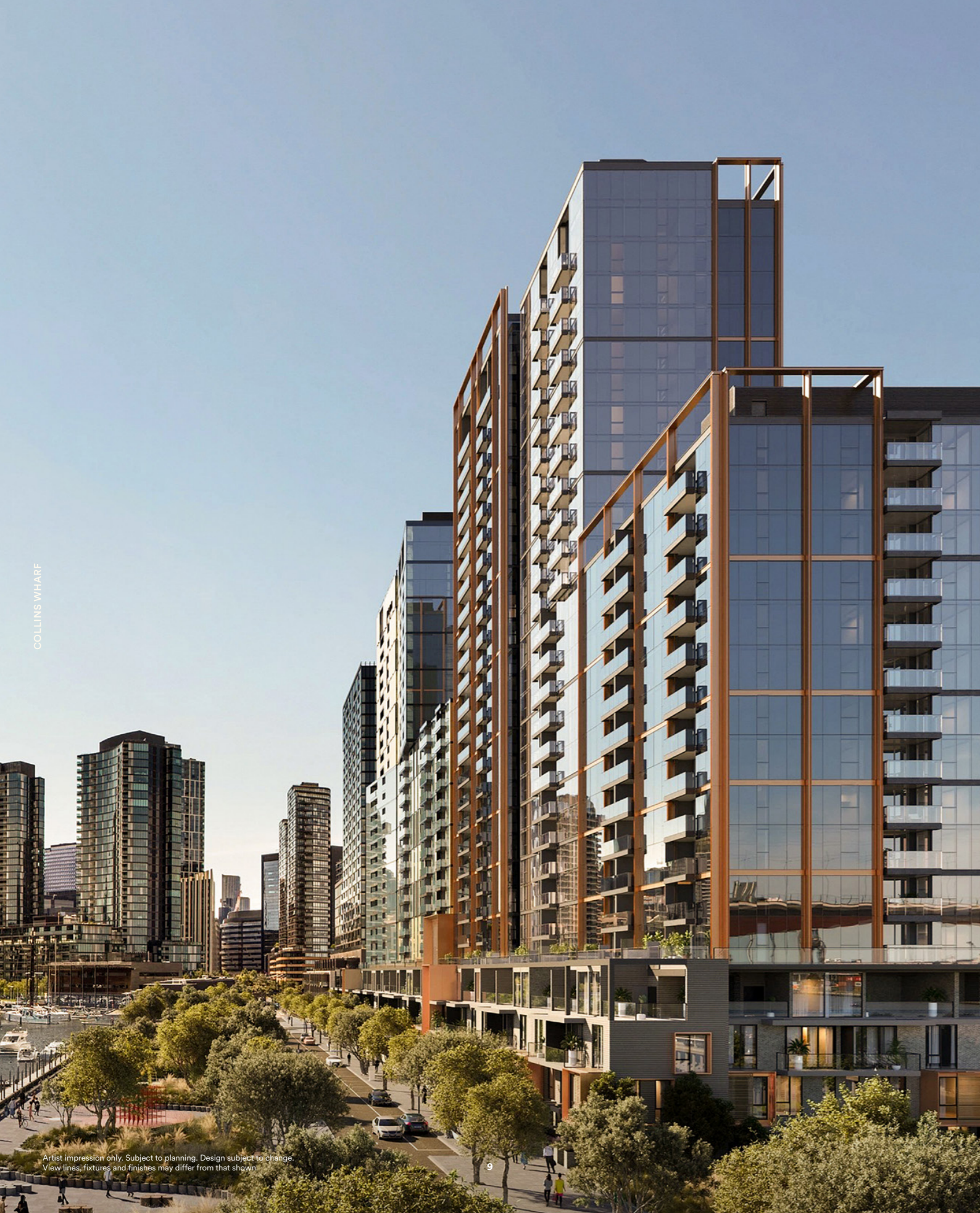
Artist impression only. Subject to planning. Design subject to change. View lines, fixtures and finishes may differ from that shown.