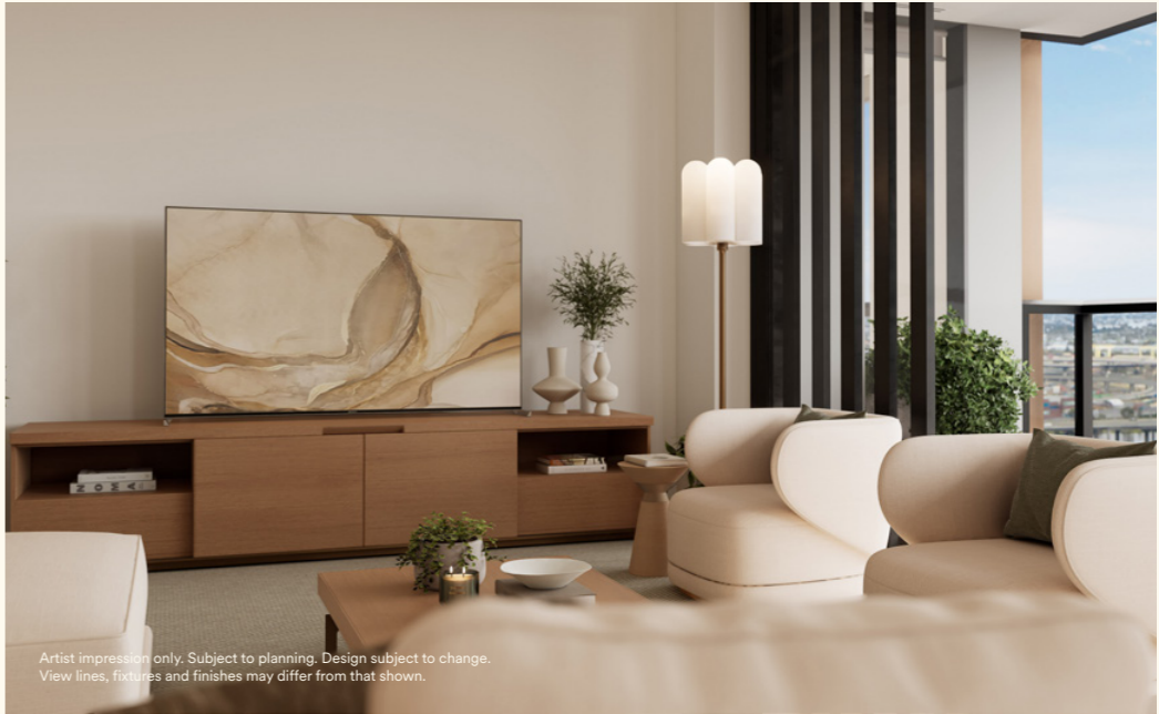
Artist impression only. Subject to planning. Design subject to change. View lines, fixtures and finishes may differ from that shown.

Ancora at Collins Wharf presents a rare chance to join this thriving neighbourhood. With postcard views of Melbourne's iconic Yarra River, Victoria Harbour and swooping views of the city, indulge in tranquil waterfront living, moments from the vibrant pulse of Melbourne's cultural hub.